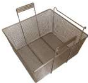
Full Size Basket