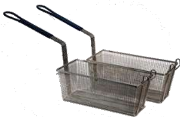
2 Half Size Baskets